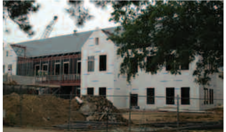
The new Student Life and Technology Center, scheduled to open for the Spring 2010 semester, takes shape in this mid-August photo.

Completing the Mabee Challenge and fully funding construction of the new Student Life and Technology Center will be the primary focus of the College's fund-raising efforts in 2008-2009.