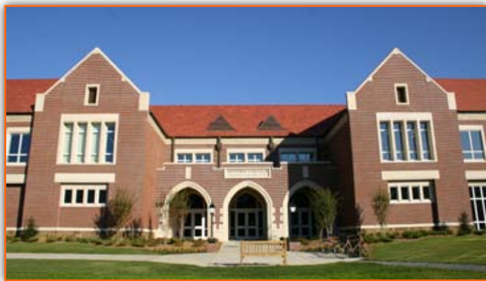
(Front view of the Wellness and Athletic Center)

The Warriors finished construction of their new athletic facilities in August of 2007. The new buildings and playing fields replaced the 46-year-old Grove Gymnasium. Hendrix has also recently finished construction of the new Student Life and Technology Center, which has been erected on the west side of Harkrider where Grove Gymnasium formerly sat.