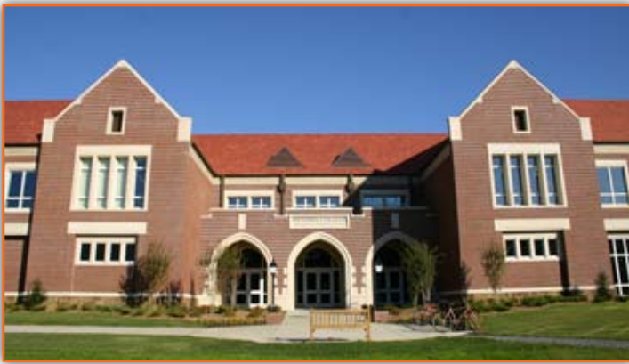
(Front view of the Wellness and Athletic Center)