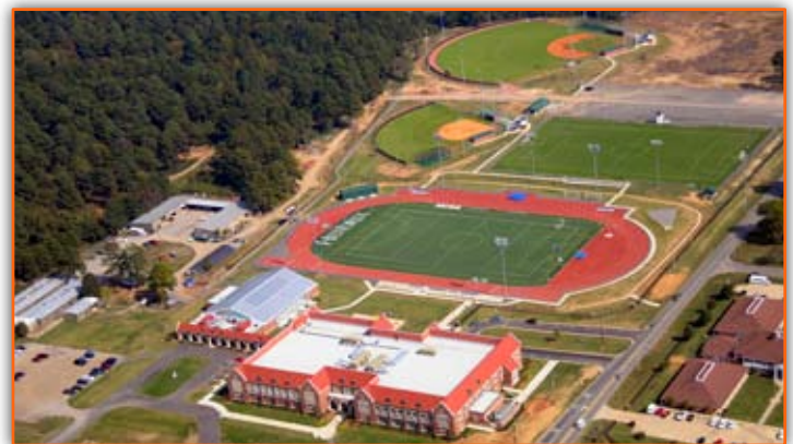
(Aerial view of the top-ranked Warrior facilities)

Other ranking lists are based on student reports about their student body's political leanings, race/class relations, gay community acceptance, and other aspects of campus life. A college's appearance on a ranking list is entirely the result of a high consensus among its surveyed students about a topic compared with that of students at other schools answering the same survey question(s) on the ranking list topic.