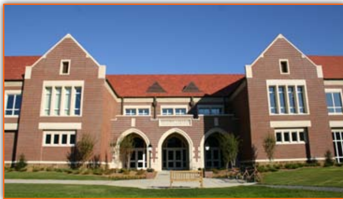
(Front view of the Wellness and Athletic Center)

The Warriors finished construction of their new athletic facilities in August of 2007. The new buildings and playing fields replaced the 46-year-old Grove Gymnasium. Hendrix has also recently finished construction of the new Student Life and Technology Center, which has been erected on the west side of Harkrider where Grove Gymnasium formerly sat.