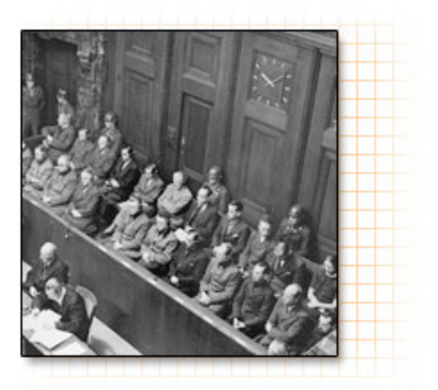
View from above of the defendants dock during a session of the Medical Case (Doctors) Trial in Nuremberg, which ran from December 9, 1946 to July 19, 1947.

In the August 1947 verdict, the judges included a section called Permissible Medical Experiments . This section became known as the Nuremberg Code ( http://ohsr.od.nih.gov/guidelines/nuremberg.html ) and was the first international code of research ethics.