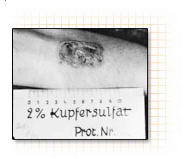
This photograph documented the results of a medical experiment that included skin burns caused by doctors at the Ravensbrueck concentration camp in 1943. It was entered into evidence at the Doctors Trial at Nuremberg.

Although not the first example of harmful research on unwilling human subjects, the experiments conducted by Nazi physicians during World War II were unprecedented in their scope and the degree of harm and suffering to which human beings were subjected.