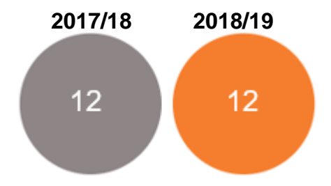
Figure 2. Number of Diversity Trainings Offered, 2017–2019